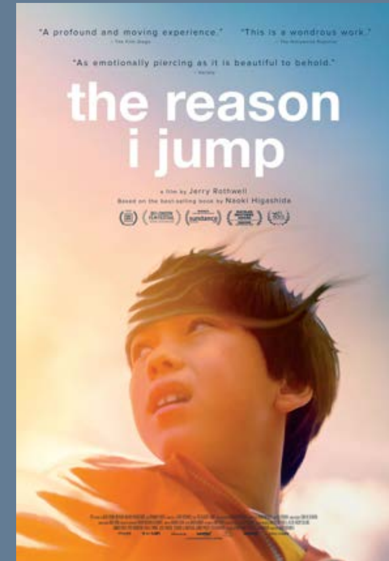
THE REASON I JUMP