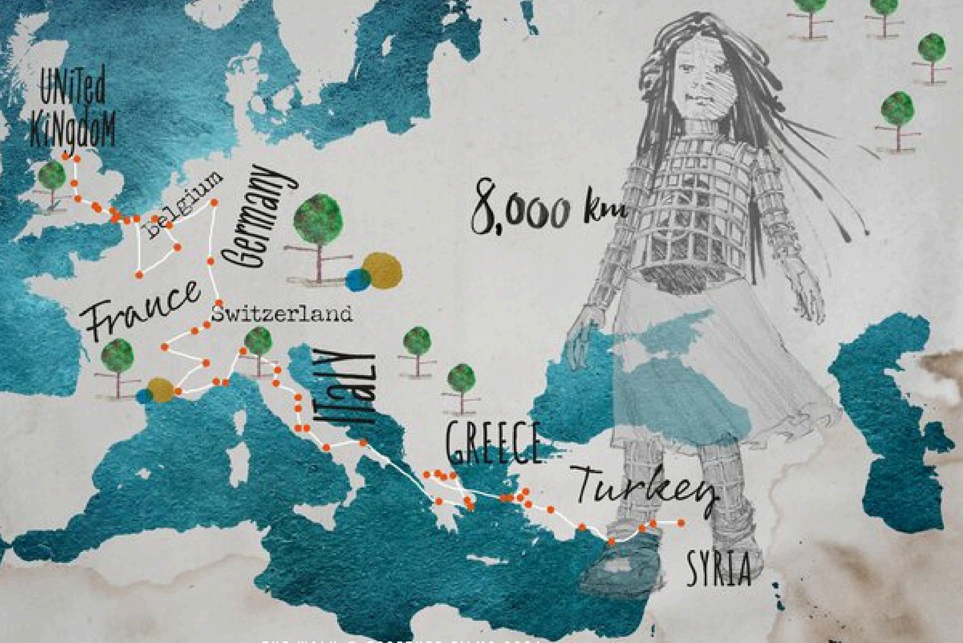
Illustration of The Walk Good Chance Theatre 2021