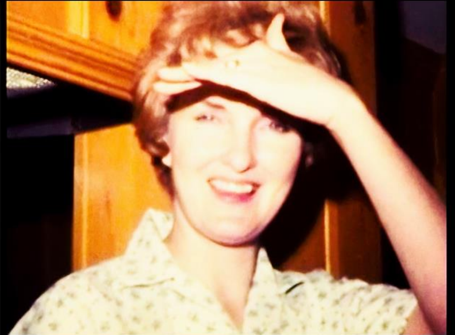
Writers Innovative Network - WIN©