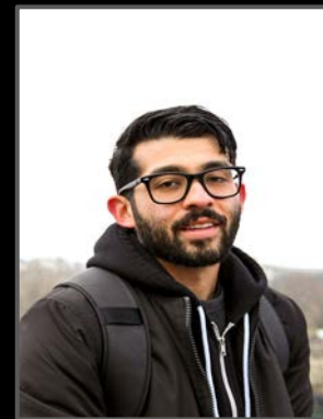
Composer: Denisse Ojeda