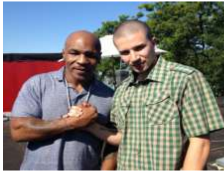
Slick on set w/Mike Tyson