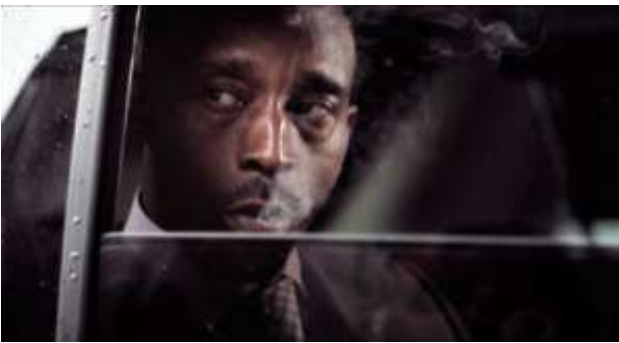
Lomatic in Full Circle fullcirclethefeature.com

Underneath the dramatically charged façade of the film are a few things that really make it special; community, interesting character development and budget. Full Circle is one of the few films that attempts to comment on the modern cultural aesthetics of bushwick as a neighborhood. The film is comparable to Spike Lee's depictions of Brooklyn in some of his earlier works. Bushwick was once typically geared towards lower income/middle class families, but in recent years, some parts have been transforming with loft spaces and artists. It is a diverse area in every sense of the word. Many scenes were filmed in Tony's Pizzeria on well-known Knickerbocker Avenue. Tony's has been a reliable, local restaurant for years. Anthoni describes the neighborhood vividly in the opening scenes when stating, "If there was a street between good and evil- it'd be right here between a bodega and a barbershop." Naim is giving back to his community with this film. "I'm from New York City but lived in bushwick for the last 5 years and it's where I honed all my talent and became a man. I wanted to showcase the neighborhood and some of the crazy characters in it."