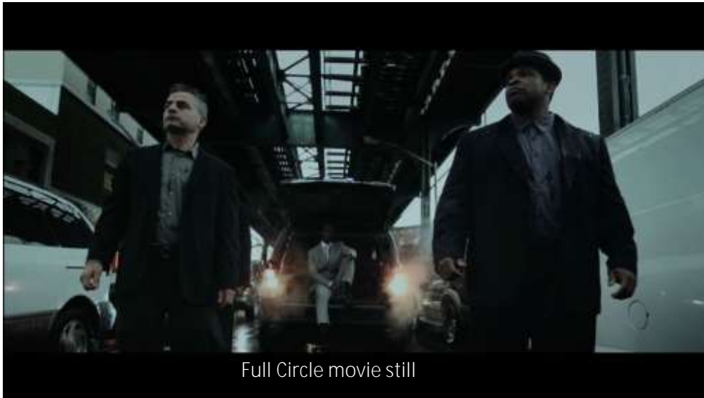
Full Circle movie still