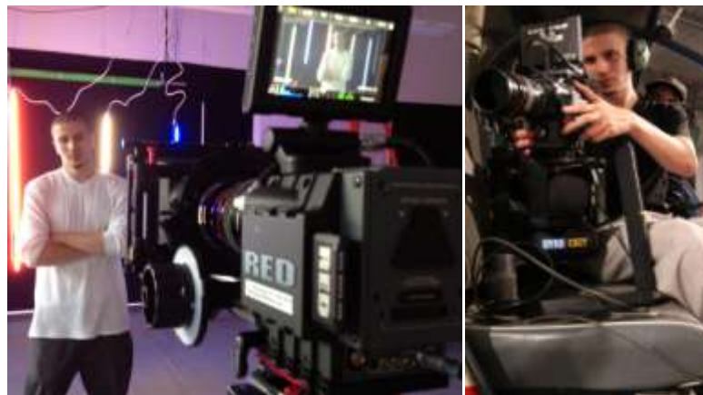
Slick in action