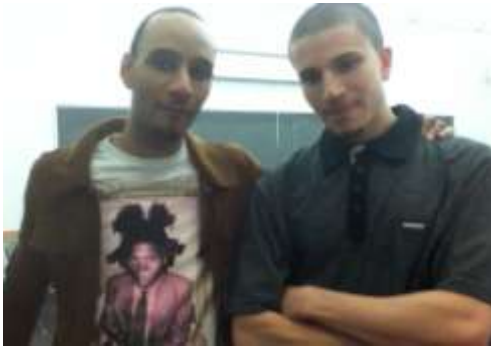
Swizz Beatz w/ Slick the Misfit