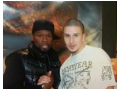
Slick w/50 Cent